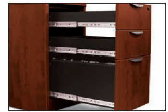
Top quality full extension ball bearing slides on box AND file drawers. (ADC only)