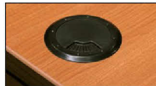
Grommets are standard on desks, returns, bridges, credenzas, extended corners and hutches.