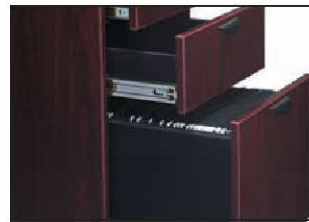
Top quality full extension ball bearing slides on file drawers. Top quality 3/4 extension ball bearing slides on box drawers. (AML and ACL only)