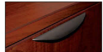
6 1/2" wide handle pulls on pedestals and storage. (ADC only)

All dimensions are shown in inches. Prices shown are current manufacturer's suggested list price at the time of printing. All applicable taxes are extra. Descriptions, specifications and prices are subject to change without notice.