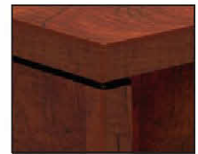
Matching 3mm PVC "Super Edge" on all edges