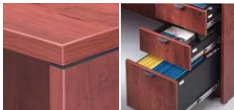
3 mil PVC Tough Edge