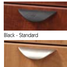
Black - Standard