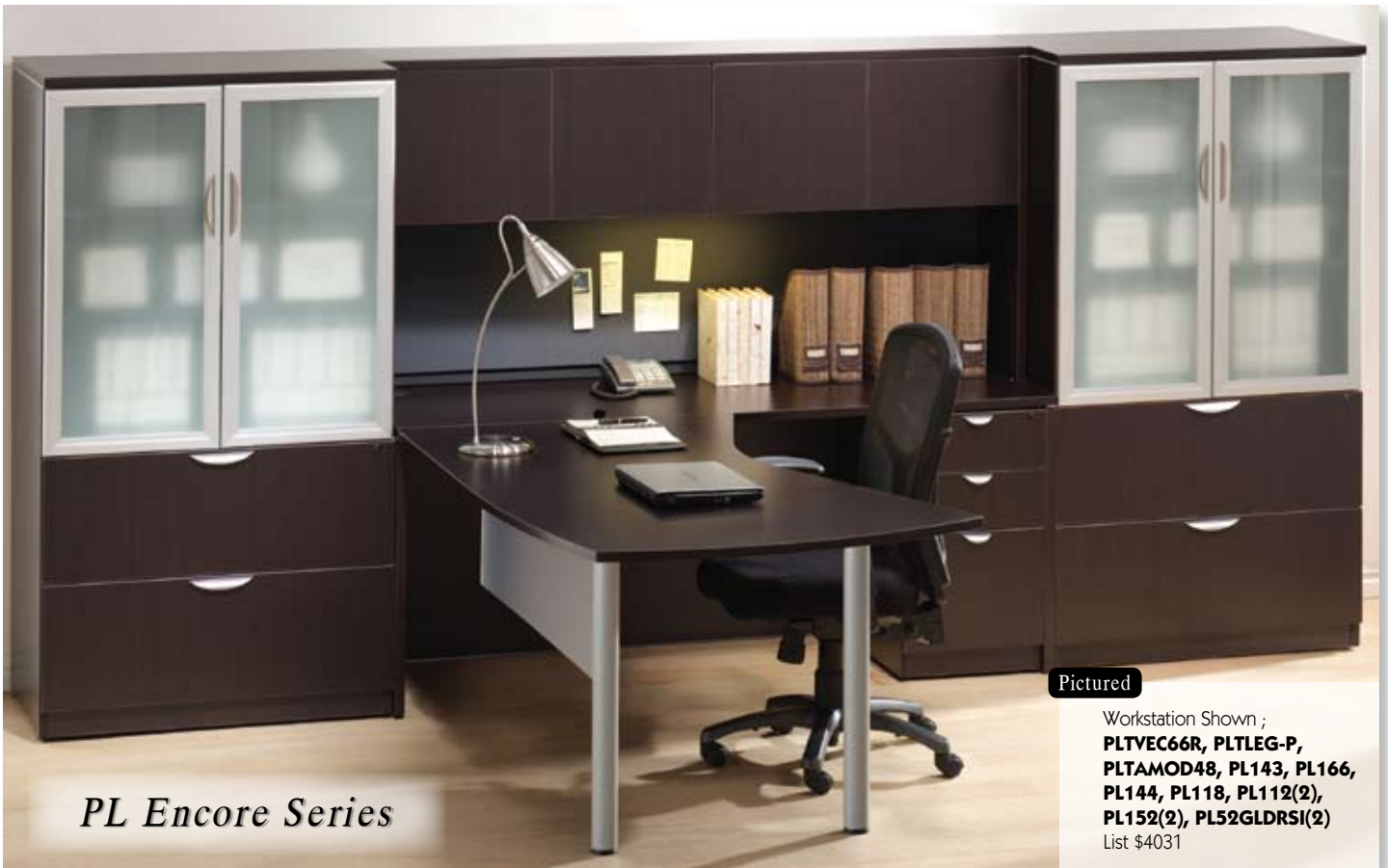
PL Encore Series