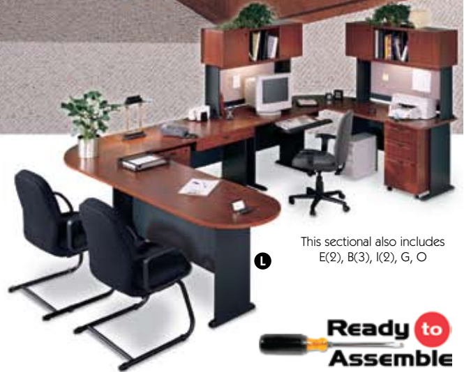
This sectional also includes E(2), B(3), I(2), G, O