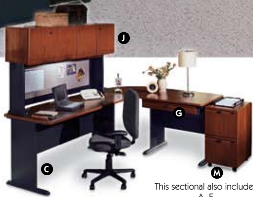
This sectional also includes A, E